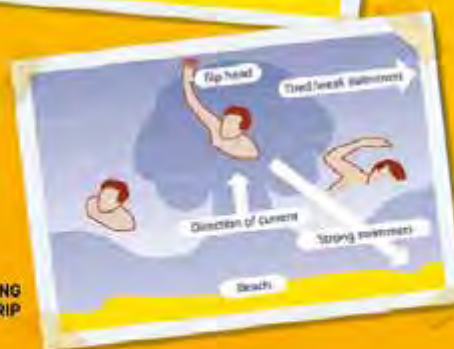
ESCAPING A RIP