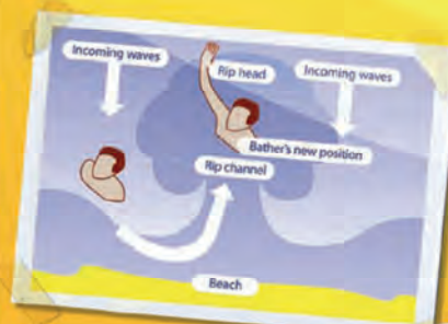
CAUGHT IN A RIP